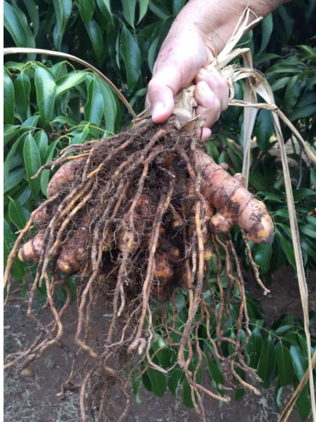
Growing crops in containers, for example turmeric